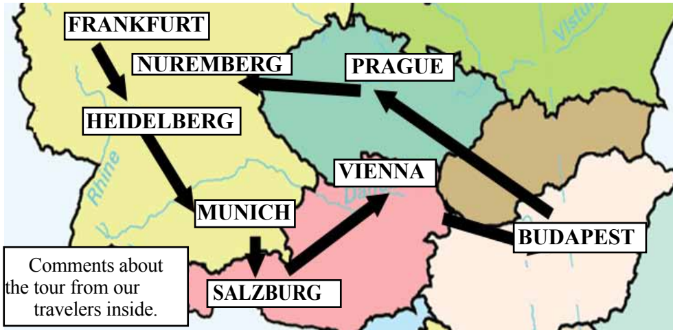
Leisurely pace with 2-3 nights in each place.

Our journey will take us to the most interesting cities in Germany, Hungary, the Czech Republic and Austria. Castles, palaces, cobblestone streets, and medieval markets abound in the historic Old Towns in each of our destinations, and we will take the time to see them properly. Traveling by first-class train and staying in centrally located hotels will give us the luxury to really experience the local culture and see it as it really is.