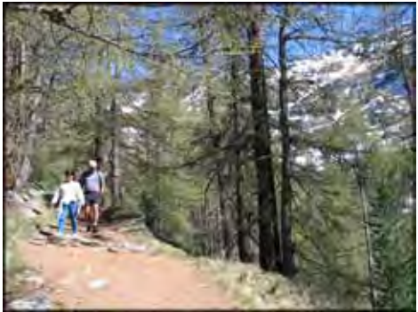
small shopping malls. Here you can truly have it all. You can easily spend the entire day out in the mountains, walking, riding, eating, and enjoying the astonishing views.

From here we embark on another spectacular train journey that takes us from Zermatt out into the Rhone Valley, to Brig and the Oberwald pass. You are getting the very best of Swiss engineering, with their unique ability to take a train almost anywhere, with utmost comfort.