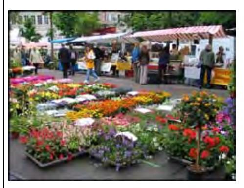
dock, to the more tranquil, tree-lined Arboretum gardens, six blocks west.

Fraumunster post office has a lovely sidewalk arcade in the Florentine style. The lake shore is two blocks further -- the scene of a lively, morning market selling flowers, cheese, breads, fruits and vegetables. Those interested in taking an extended walk along the lake can enjoy a scenic stroll from the lively Burkliplatz, where excursion boats