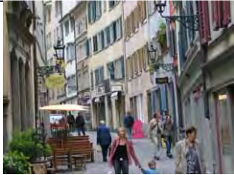
The Old Town extends about five blocks in from both sides of the river and stretches for about a mile. The right bank, or east side, of the river has the larger cluster of old buildings and is considered the prime district for visitors. Much of your first day can be devoted to exploring its many little side alleys and shops.