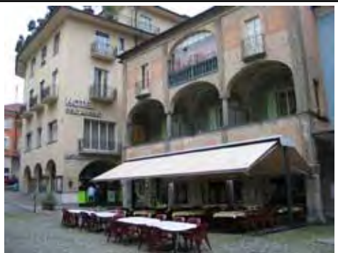
little stores to browse in, with a nearby morning food market. They also have a casino where you could try your luck.

Locarno's Old Town extends for about six blocks by four blocks so it's not really huge but it's big enough to enjoy a nice stroll and browse in the shops, art galleries and antique Shopkeepers are friendly stores. and welcome you to come in to look around. You'll find quite a few modern stores intermingled with the old, scattered among the hidden lanes and quiet spaces in the back of the town. There's a nice shady, cozy feeling in the narrow alleys where vou can walk from one end to the other. and there are some smaller piazzas tucked away on the side streets as well. You could easily spend a few hours just meandering and strolling, getting a little bit lost -- but you'll quickly find your way again in such a little place this.