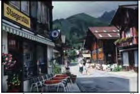
It only takes ten minutes to walk from one end of Murren to the other.