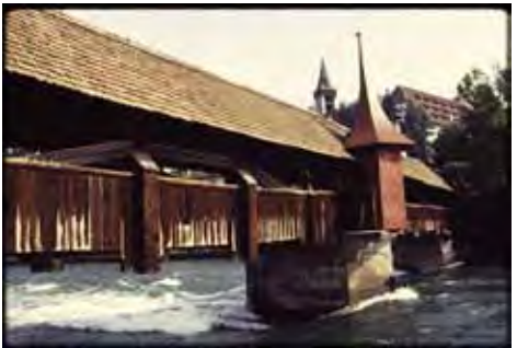
into your foreground with the bridge and tower behind.

The Mill Bridge is a smaller covered bridge two hundred yards south along the river, built around 1408, notable for its series of paintings, "The Dance of Death," whose jangling skeletons of the Black Death make you feel lucky to be alive. The clever Swiss have once again harnessed the waterpower that originally gave this bridge its name, and created a modern electricitygenerating turbine, underwater and