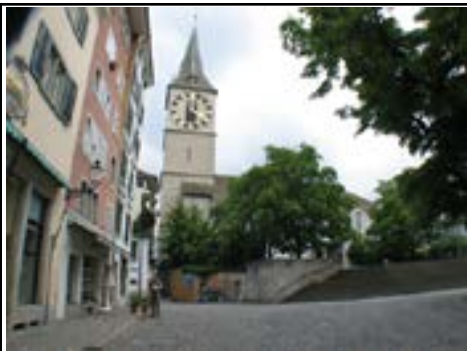
DAY ONE: Old Town

Today's itinerary could be summarized as simply wandering up and down nearly every little lane in the Old Town, which is an ideal version of the best imaginable collection of historic buildings set amid a delightful tangle of narrow, cobblestone pedestrian alleys. Disney could not have done it better, but this is the real thing. Leave it to the Swiss to preserve their past and maintain these 500-year-old